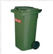
2-wheeled container systems

Our complete product range comprises plastic and steel refuse containers as well as underground systems, city furniture and innovative weighing and identification systems for all aspects of collection logistics.