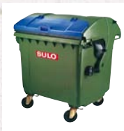
4-wheeled container systems